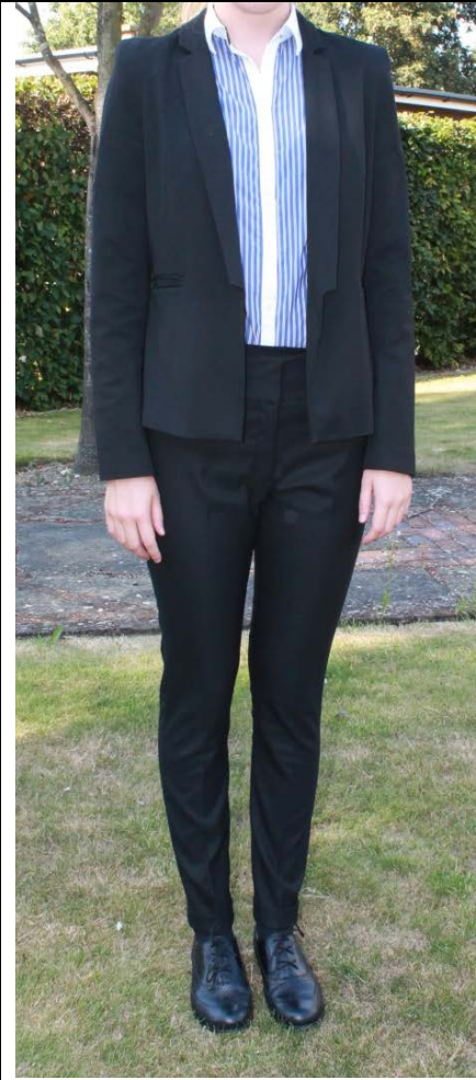
Sixth Form Boys