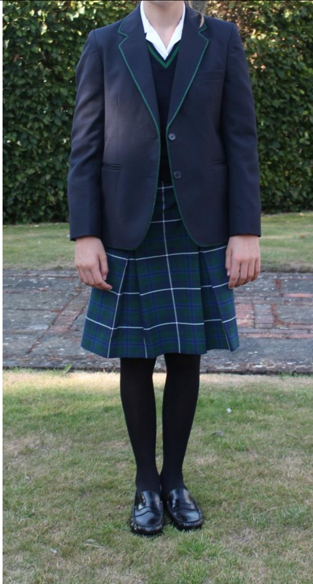
Uniform B - Lower School